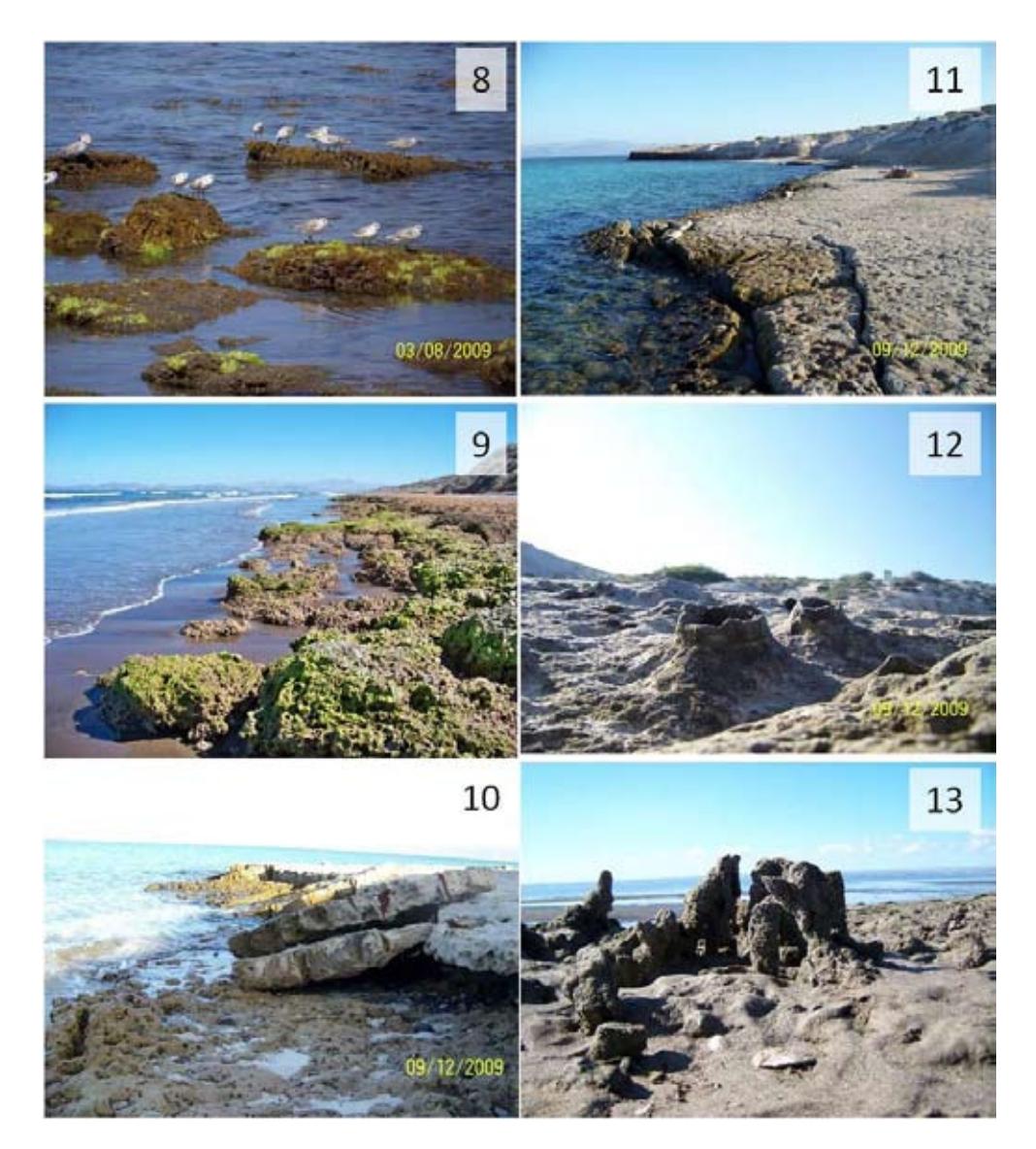
Figures 8-13. Thrombolithic formations in different localities of Bahía de La Paz, B.C.S., Mexico: 8) Blocks in the intertidal covered by green macroalgae at high tide at Las Brisas; 9) Thrombolithic formation in the intertidal covered by green macroalgae during low tide at Las Brisas; 10) Non-lacunar thrombolithic platforms where two separate episodes can be identified based on the two layers of beach-rock platforms at Calerita; 11) Thrombolithic platforms showing perforations at Calerita; 12) Close up of perforations in thrombolithic blocks at Calerita ; 13) Fragile rhizolith-like structures in the lower intertidal of El Mogote, La Paz lagoon.

structures (Fig. 25) may be observed in the beach areas free from mangrove cover, appearing as platforms limiting the sandy areas. Their fragmentation to different degrees is evident. In the mangrove areas dense microbial mats are conspicuous, closely associated to the Laguncularia racemosa root systems and, just behind the mangrove line, evidences of the transition from mat to pro-thrombolith can be found. Extensive soft discolored mats (Fig. 26) are found fused with the consolidated thrombolithic structure (Fig. 27).