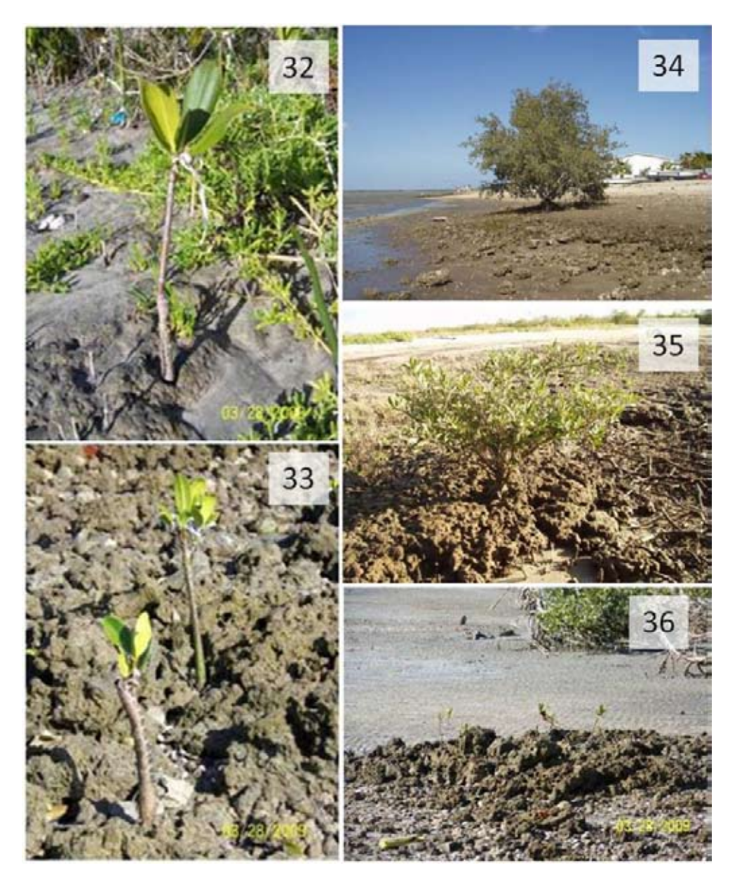
Figures 32-36. Associations between mangroves and different stages of thrombolite formation in B.C.S., Mexico: 32) Black mangrove ( Avicennia germinans ) anchored on thrombolihtic platform (La Paz lagoon; 33) White mangrove shrub ( Laguncularia rac emosa ) anchored on pro-thrombolithic platform (El Mogote, La Paz lagoon); 34) Recruits of red mangrove ( Rhizophora mangle ) anchored in soft conglomerated mat at San Carlos; 35) Recruits of red mangrove ( Rhizophora mangle ) anchored in thrombolithic outcrop at San Carlos; 36) Rhizophora mangle recruits anchored in thrombolithic platform surrounded by sand with no recruits at San Carlos.

(2006) have suggested that during the Pre-Cambrian, stromatolites and hence microbial mats had covered large areas. These may be represented by rocky ground far from the coast and living stromatolites in the intertidal, but also by extensive (non consolidated sediment) pro-thrombolithic platforms and trombolites in coasts. Therefore, extensive microbial mats such as those shown in Stal (2000) and here in figure 2 may have developed into conglomerated mats and pro-thrombolithic ground that eventually was to