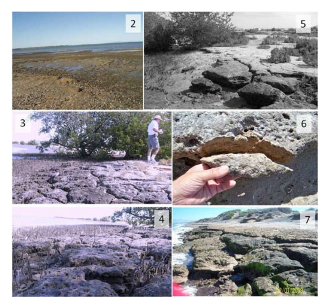
Figures 2-7. Microbial structures located in the Bahia de La Paz, B.C.S., Mexico, mainly inside the lagoon: 2) Extensive cyanobacterial mats (far view) and pro-thrombolithic platform (close view) in Centenario SW margin of La Paz lagoon; 3) Fragmented pro-thrombolite platform supporting mangroves ( Avicennia germinans ) in Marina Sur; 4) Eroded platform showing channels in Marina Sur; 5) Detached blocks with eroded bases in Marina Sur that remind of the bun shaped stromatolites of Shark Bay, Australia; 6) Structures showing the same clotted matrix and sheet cover as other pro-thrombolithic platforms in Marina Sur; 7) Non-lacunar thrombolithic blocks and platforms showing smooth surfaces covered with cyanobacteria at Las Brisas north outside of the lagoon.

ous in various sites, either as exposed (Fig. 16) or protected (lacunar) platforms (Fig. 17), and lithified bridge-like structures (Fig. 18). In Isla San José, however, pro-thrombolithic formations seemed incipient, associated to thick microbial mats (Figs. 19-20). Further exploration is required at Isla San José inasmuch formation of sandbars, very similar to El Mogote in La Paz lagoon, suggest past pro-thrombolithic activity in several sites.