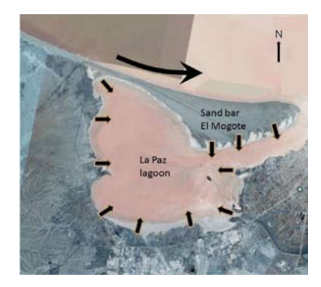
Figure 37. La Paz coastal lagoon in the southern Baja California peninsula. Large arrow indicates the growth of the sandbar along approximately 6000 years. Small arrows indicate pro-thrombolithic accretion along the internal margins of the lagoon, based on recorded platforms and extensive cyanobacterial mats.

Based on the above along with reports of pro-thrombolites from Laguna San Ignacio in the western coast of the Baja California peninsula (Siqueiros-Beltrones et al. , 2008), and the observations in Bahía Magdalena we further support the hypothesis that microbial mats through pro-thrombolithic ground formation may have promoted the generation of coastal lagoons throughout NW Mexico. Thus, as more information becomes available, Lovelock's