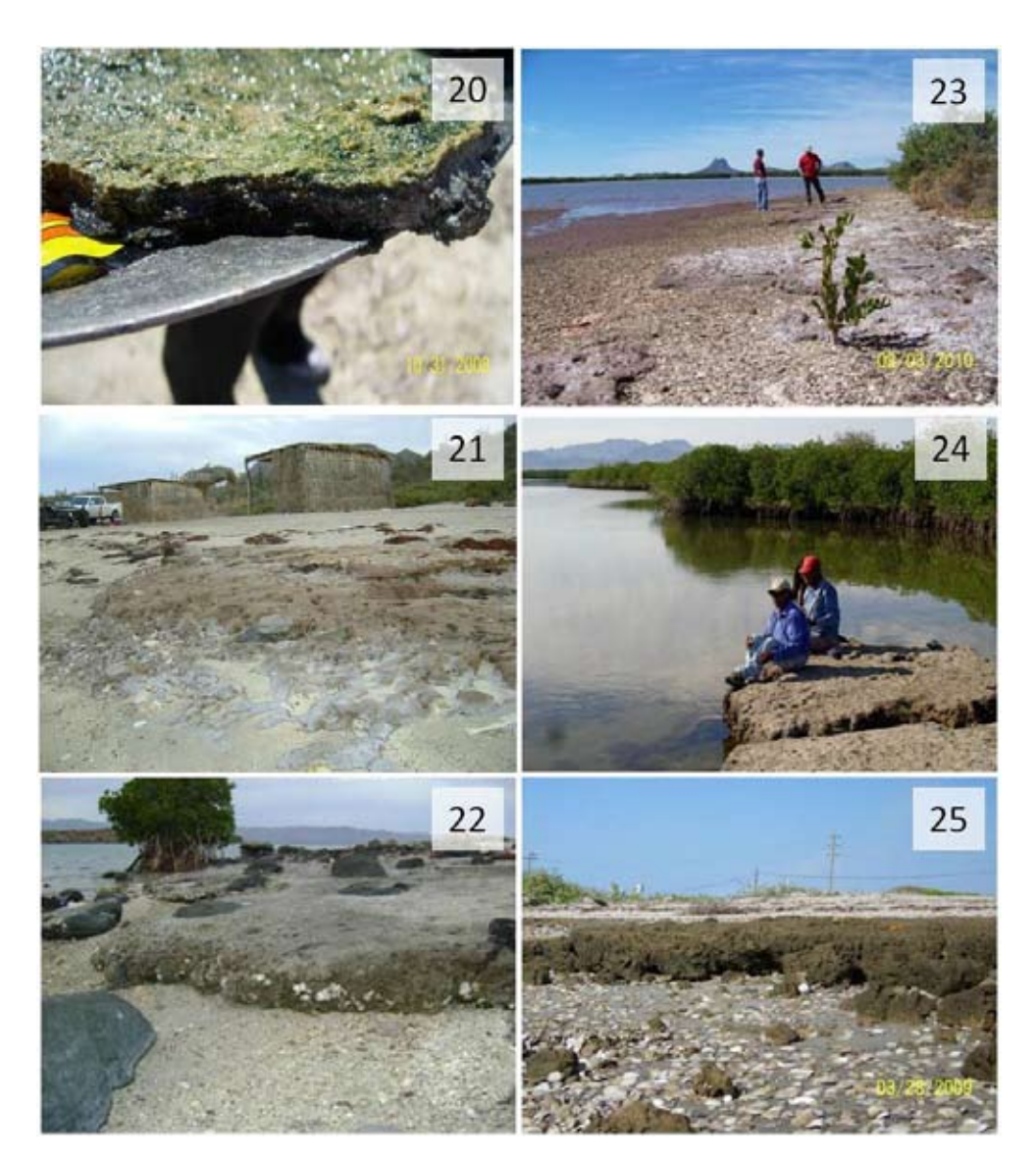
Figures 20-25. Pro-thrombolithic structures in other localities of the Gulf of California, Mexico: 20)Thick cyanobacterial mat from the intertidal of Isla San José; 21) Pro-thrombolithic muddy platform at El Requesón, Bahía Concepción; 22) Lithified thrombolithic platform and Laguncularia racemosa specimen; 23) Thrombolithic platform at Estero El Soldado, Sonora; 24) Seri natives seating on a thrombolithic block in Estero Santa Rosa, Sonora; 25) Thrombolite platform and fragments in the upper intertidal area of San Carlos beach, Bahía Magdalena, west coast of B.C.S.

La Paz lagoon (Siqueiros-Beltrones, 2008) where environmental conditions are much alike. Mineralogical analyses indicate that grains from San Carlos are probably formed under marine conditions and the acid treated samples show a similar degree of selection indicating that they come from sites under similar (low) energy conditions.